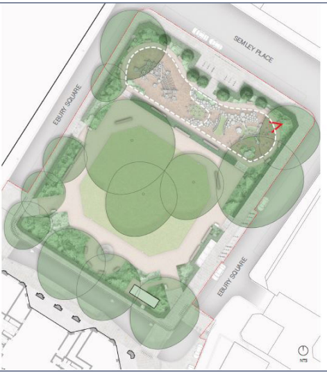
Plan of Ebury Square Gardens as proposed in May 2020 (original submission)

Relocate cycle stands away from Semley Place