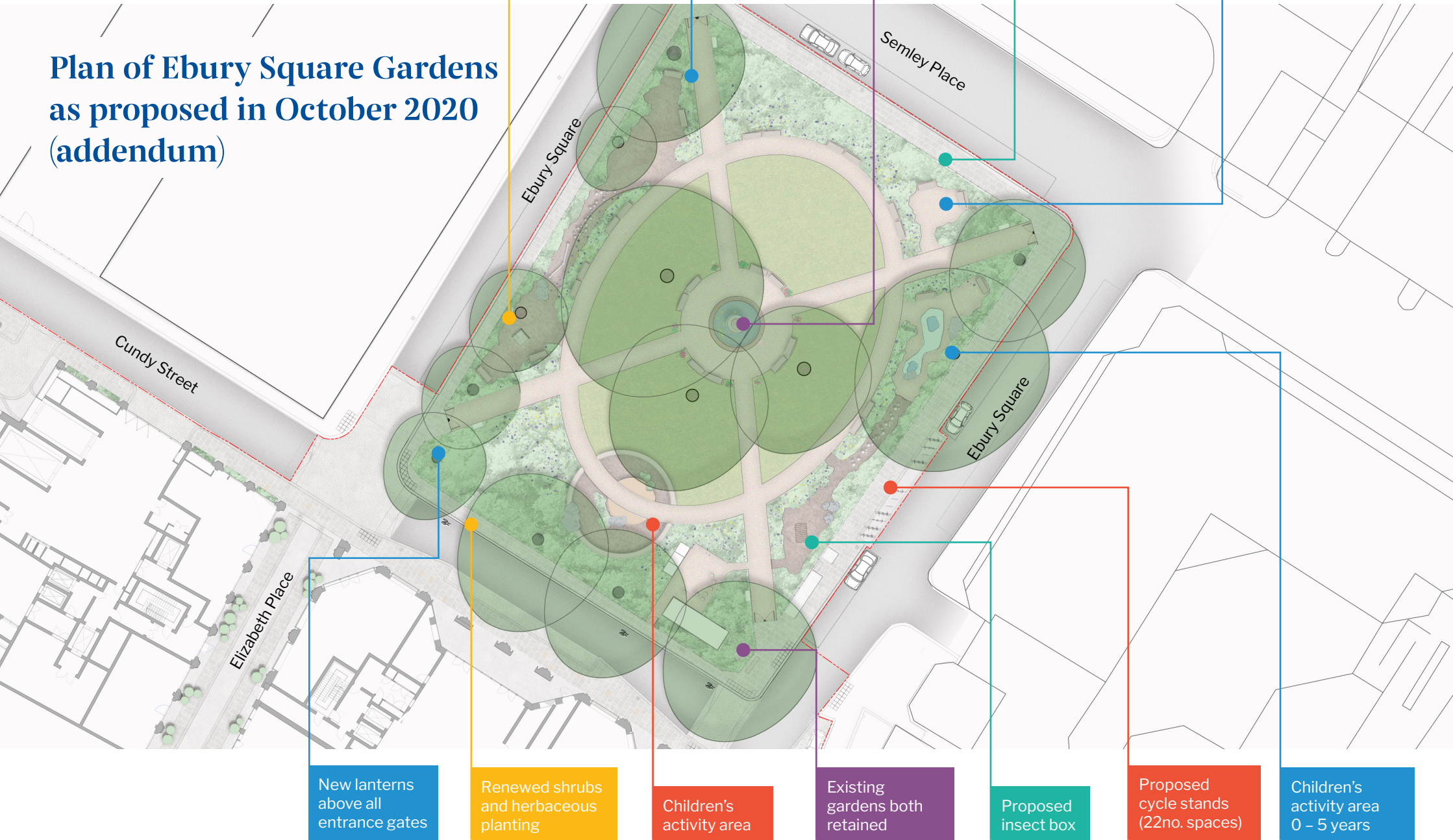
Plan of Ebury Square Gardens as proposed in October 2020 (addendum)