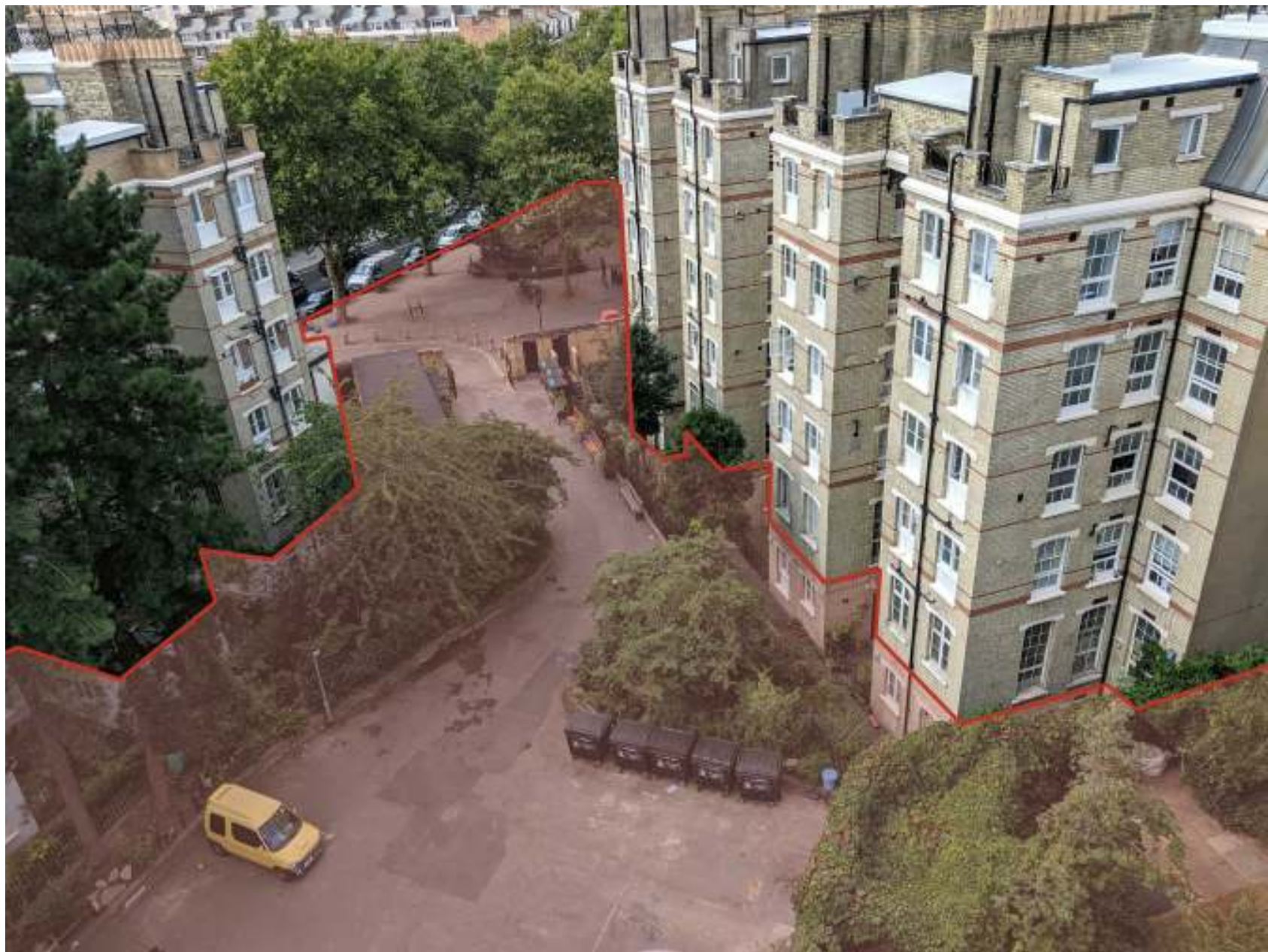
3 Photograph 1