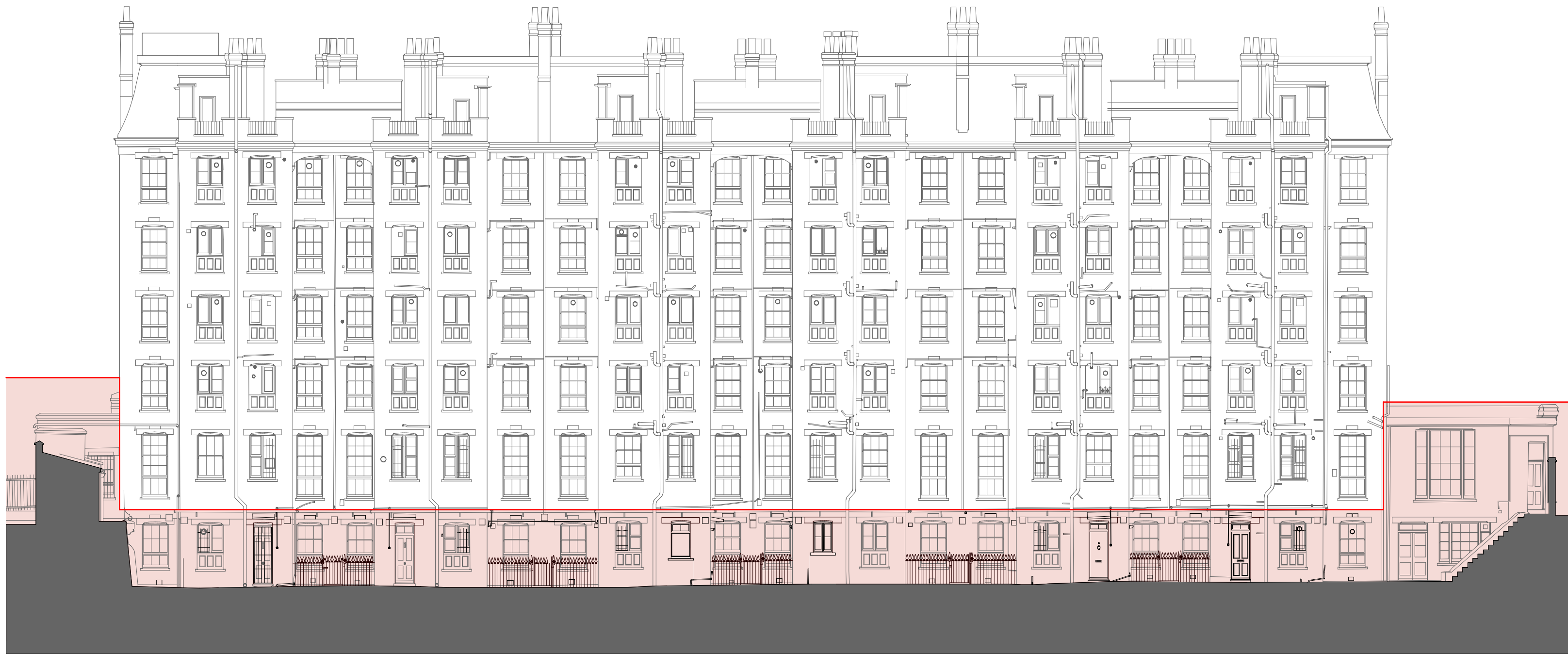
1 Coleshill Flats Elevation 1

Planning Boundary Only 9 of the lower ground floor residential units are subject to this application