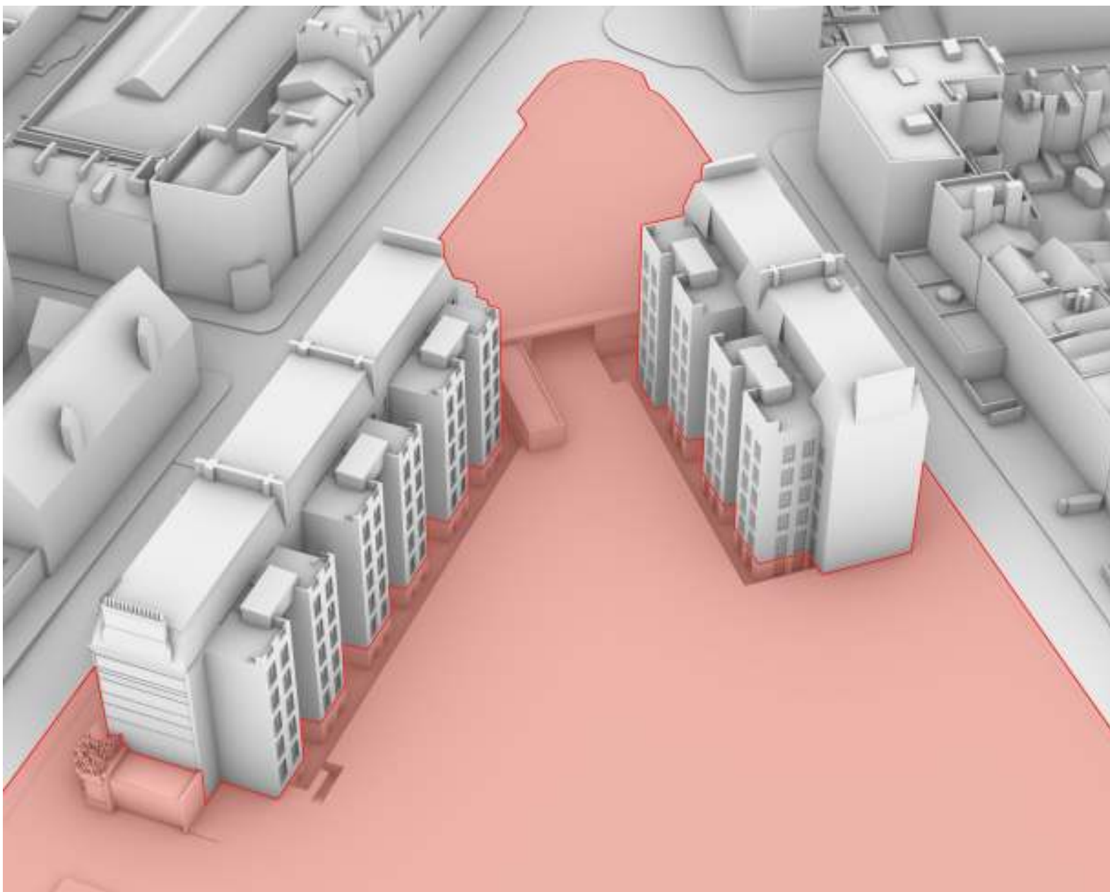
4 View 1