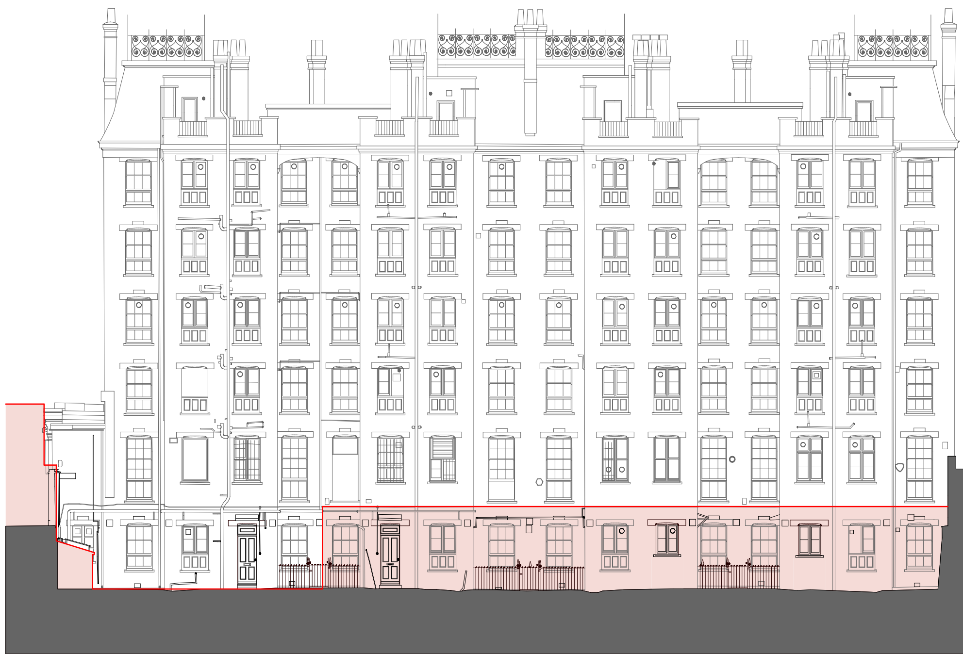
2 Coleshill Flats Elevation 2